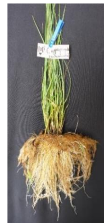
Left and centre: Set up of pots for the trial on peat forming potential of sedges. Right: Carex appropinquata whole plant (above and below ground biomass)