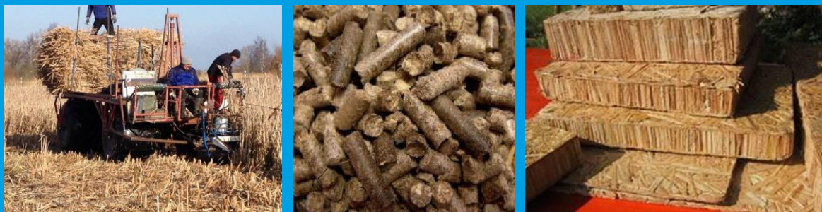
Left: Typha harvest in Kamp, Germany. Centre and right: Energy pellets and construction plates made of common reed and cattail, respectively..

Paludiculture is the sustainable agricultural and forestry use of wet and rewetted peatlands (wet organic soils). Biomass harvesting and productive use of wet mineral soils is accordingly. Both paludiculture and agriculture on wet mineral soils are suitable management approaches in wetland buffer zones (WBZs). Typical wetland plants, such as cattail ( Typha spp.) or common reed ( Phragmites australis ), grow well on nutrient-rich soils with a water table level of up to one meter above ground. Depending on species and biomass quality, the harvested biomass can be used as building material (e.g., insulation, roof thatching), or for bioenergy. In this way, paludiculture represents a win-win-situation of restoring degraded peatlands and continuing to use the land in an environmentally friendly manner. In addition, harvesting of biomass helps to remove nutrients (including agricultural pollutants) from WBZs, which prevents them from being discharged into surface- and groundwaters. Studies in fens (ground- and surface-water-fed peatlands) in the Netherlands involving biomass harvest showed nitrogen retention efficiencies of up to 93-99% (Koerselmann 1989, Wassen & Olde Venterink 2009). Other types of paludiculture are currently tested: Growing of Sphagnum mosses on rewetted bogs might substitute peat in horticulture and grazing with water buffalos can be a sustainable way to produce meat and dairy products in wetlands.