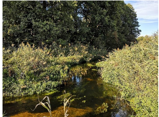
Riparian wetland in the Neman catchment area, Poland (J. Peters).

necessary to rewet drained peatlands, but first of all to protect the intact ones.